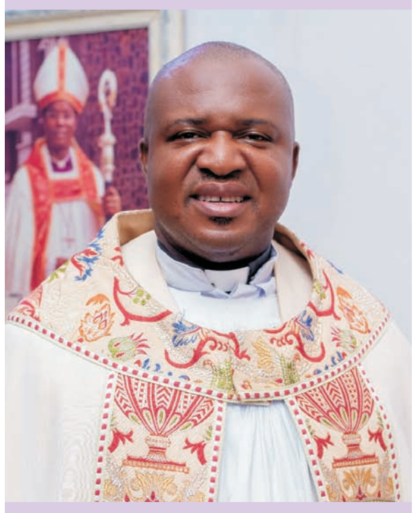
THE VEN. IKECHUKWU EGBUONU The Bishop-Elect Diocese of Oji River